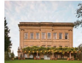
South West Bailbrook House Hotel, Bath