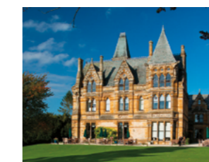
West Midlands Ettington Park Hotel, Warwickshire