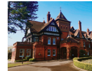
South Woodlands Park Hotel, Surrey