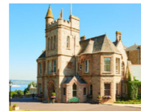
Northern Ireland Culloden Estate and Spa, Belfast