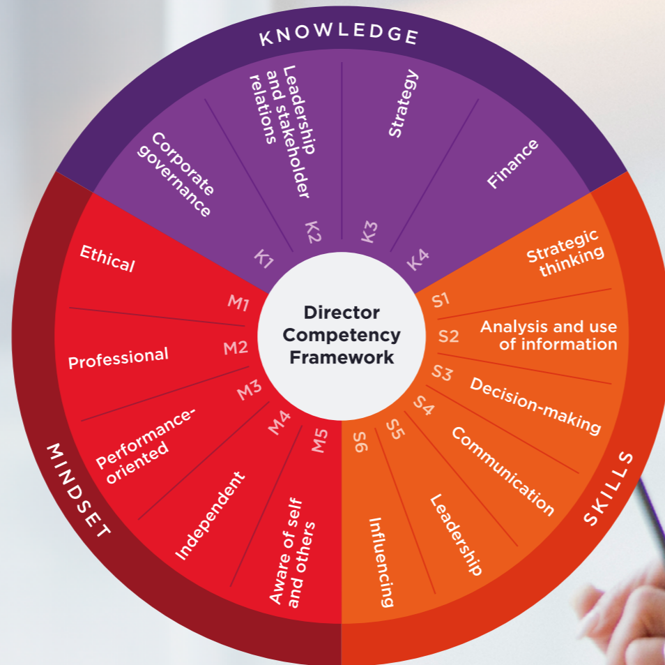
Director Competency Framework

Have a look at the Director Competency Framework at iod.com to see how you measure up.