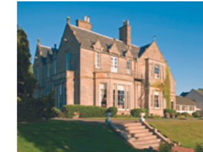
Scotland Norton House Hotel, Edinburgh