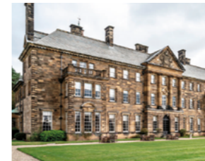
North East Crathorne Hall Hotel, Yarm

The five-day residential course offers time-poor directors a faster way to upskill, and is a great solution for leadership teams seeking to develop a shared approach to governance, finance, strategy and leadership.