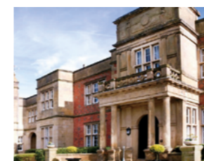
North West De Vere Cranage Estate, Cheshire