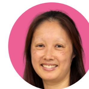
Argentina Hung FloD